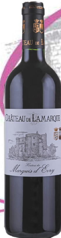
Château De Lamarque Grand Vin